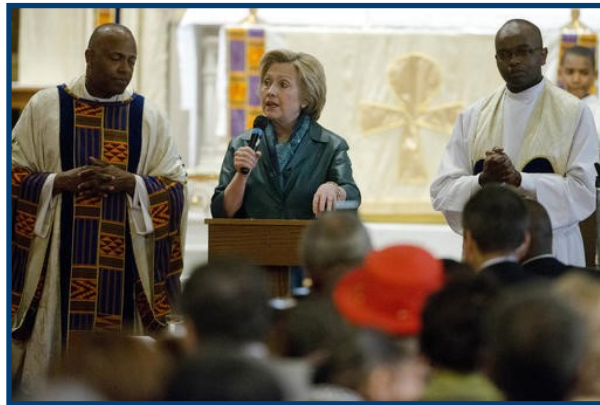
St. Thomas African Episcopal Church. April 24, 2016

As a part of the Confirmation process, each student will be engaged in worship leadership on May 15. Whether serving as greeters, ushers, or speakers, their gifts will be abundantly shared with the congregation. Please keep our confirmands in your prayers as they continue on their spiritual journey.