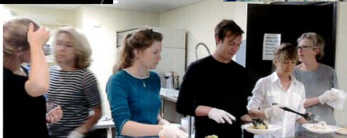
Life Center of Eastern Delaware County