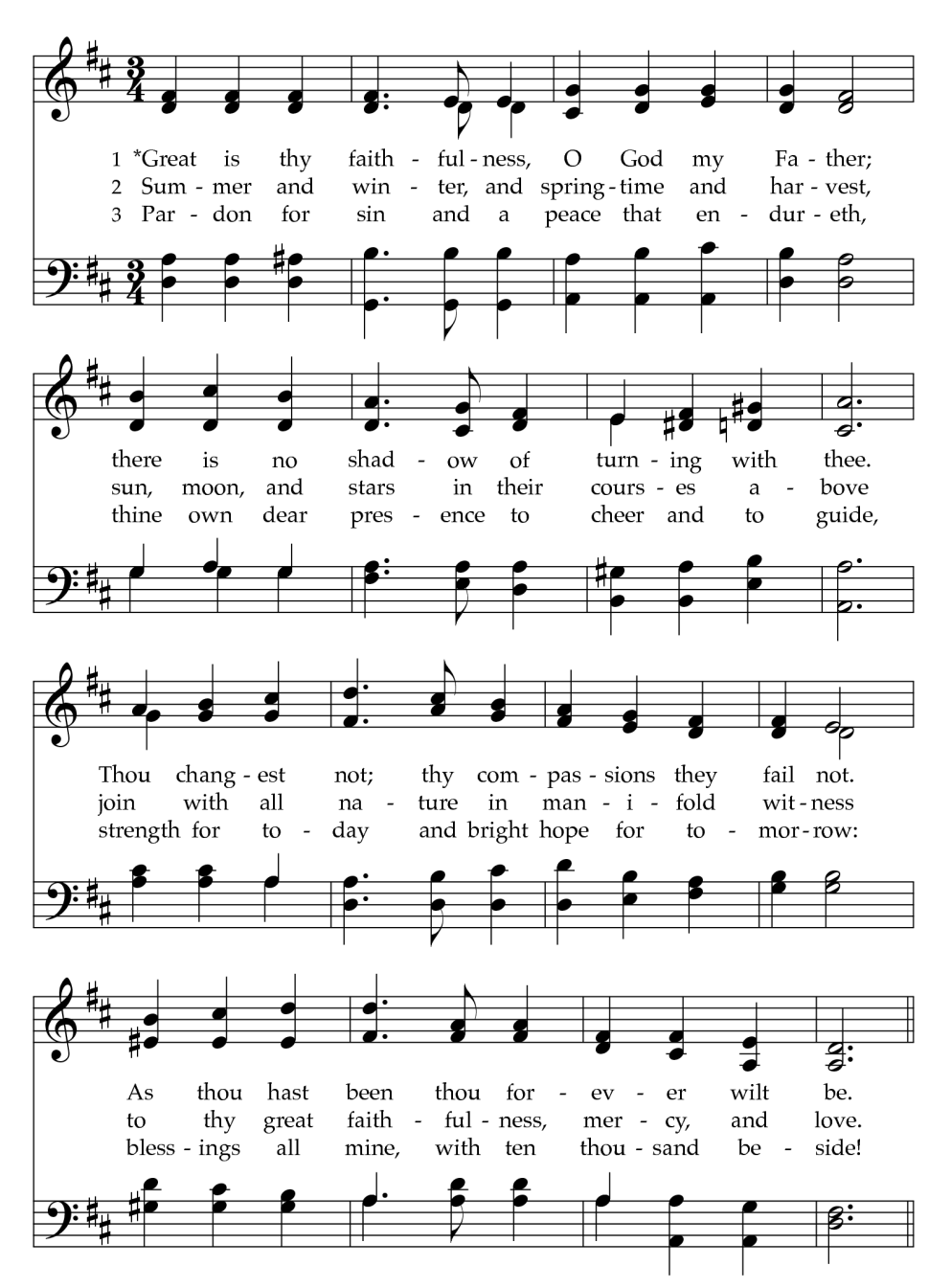
*Or "Great is thy faithfulness, O God, Creator."